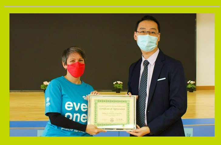
Our local impact

Recently, we went to Chak On Estate and renovated walls and ceilings for elderly families living in substandard conditions. Flaking paint was affecting their daily activities, such as sleeping, eating, and cooking.