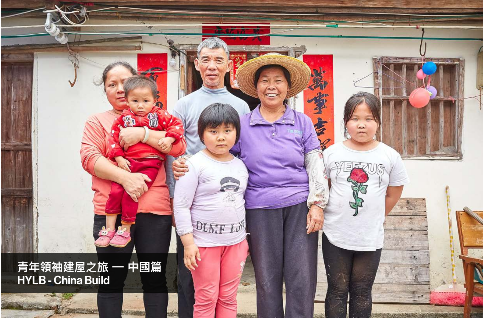
青年領袖建屋之旅 — 中國篇 HYLB - China Build