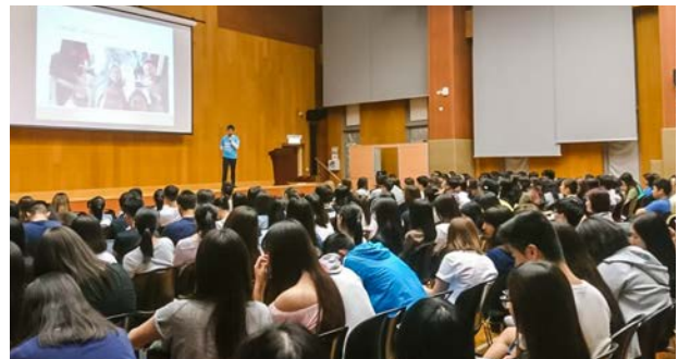
香港仔浸信會呂明才書院聖誕聯歡會講座 Aberdeen Baptist Lui Ming Choi College Christmas Celebration