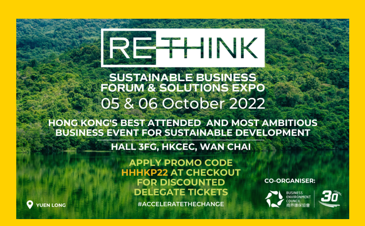
Together, we build a better future

At the forum, Habitat emphasised that the global housing deficit is rooted in systemic inequities, which are exacerbated by global stressors such as the Ukraine crisis and other conflicts as well as the COVID-19 pandemic, climate change, political instability and migration. A report released by Habitat for Humanity in 2021 found that a critical component of UN Sustainable Development Goal 11 — access to adequate and affordable housing — was one of only a handful of SDG indicators that is regressing. This reversal of previous progress reflects the global housing crisis that continues to affect millions around the world, threatening the world's ability to achieve other goals related to poverty alleviation, including those focused on water, sanitation and health, gender equality and clean energy.