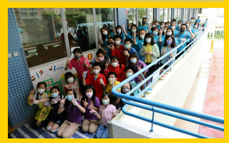
Our local impact

If you are interested, please contact <u>partnerships@habitat.org.hk</u> for more information.