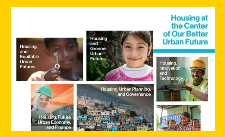
Our global impact

The 11th World Urban Forum opened in Katowice, Poland last month. Habitat for Humanity International called attention to the enormous need for sustainable, equitable housing solutions. The global housing nonprofit hosted several events at the biennial forum to ensure housing is at the centre of conversations, which will stem from this year's theme: Transforming Our Cities for a Better Urban Future.